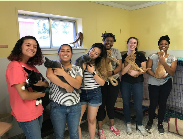
Pre-Vet Club of Southern Adventist

It is difficult to quantify how our volunteers make a difference for our animals and shelter. In 2018 we had a total of 2,869 hours dedicated to volunteering at the shelter and Petco, but that does not tell the full story. There is a very long list of tasks that are required and cover a spectrum from dish washing to facility maintenance. If we were able to capture the number of hours our fosters put in to preparing their house guests for their forever homes or the hours spent at adoption events or helping at the fundraisers, we would easily double or triple the hours shown. Thank you to all of our volunteers. You have made a big difference.