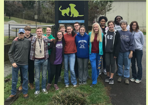
Boyd Buchanan Volunteers