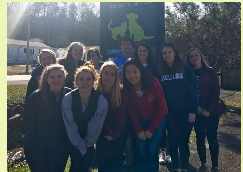
Baylor MLK Service Day