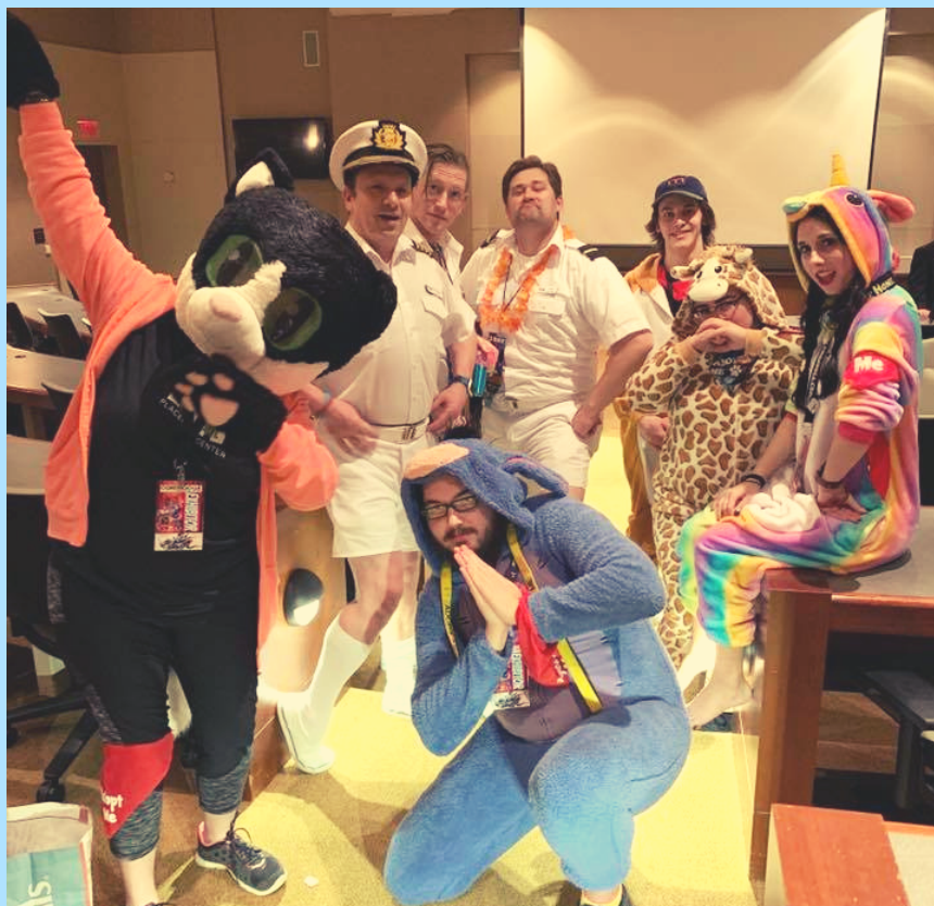
PPC Staff and Friends At Con Nooga (2/23/19)

Pet Placement Center may be a smaller sized shelter, but the effort our staff puts in is HUGE. We don't just clean up after our animals and provide necessary care, our staff puts in long hours socializing scared animals, providing enrichment to keep our animals stimulated and healthy, providing therapies and medication after surgeries or during illnesses, and thoroughly getting to know each and every animal in our care. Our size makes knowing and providing personalized care and attention for each and every animal possible. This dedication shows when the public comes to our shelter and can be assured that they are being provided with all the information they need to make a sound and educated choice on what pet will be the best addition to their home and family. The staff also participates in working offsite events to promote adoptions and awareness of the shelter, they help take photographs, run animals to and from the vet, and come in early and stay late whenever they are needed. The people "behind the scenes" deserve a huge thank you for all that they do to provide a loving and safe environment for these animals to take refuge while finding their forever homes.